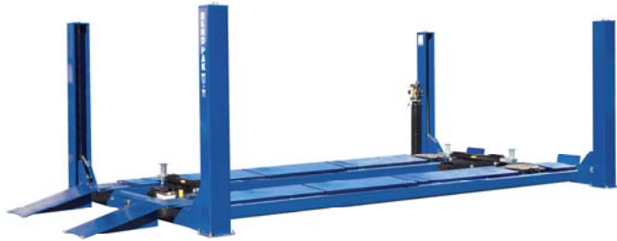
HD-Series Super-Duty Four Post Details