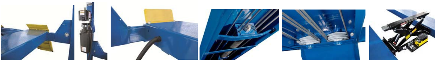
Optional RJ-7 Bridge Jacks

BendPak's HD-Series 4-post lifts are engineered to meet the strenuous demands of even your toughest professional lifting jobs. In particular, this HD-14T is the kind of sturdy beast you want as the backbone of your shop or garage. Designed into every HD-Series lift is a laundry list of key features as long as your arm to ensure that BendPak is the absolute best you can buy. Our competitors might say we overdo it, but we don't include components for the sake of frills and flash. We design our lifts with the attributes we feel should come standard with every lift—the kind of lift we would want to (and do) own. You can always count on BendPak lifts for increased durability, safety and productivity. Spend less time worrying about what you're working under and more time doing what you love. Our commercial-grade lifts are second to none and recognized the world-over as benchmarks of dependability and quality. Heck, it's how we got our slogan.