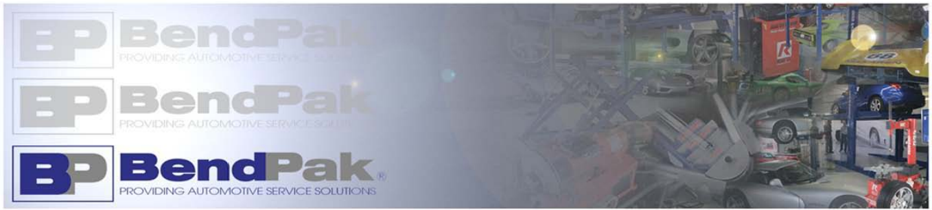
HD-Series Super-Duty Four Post Details